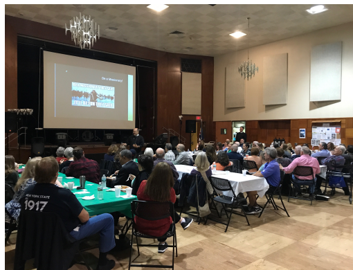
CMDA of WNY Fusion Dinner on September 9, 2017

Please pray for our Fusion dinners where healthcare students, professionals and interested friends come together on the first Saturday of every month to explore how Jesus is advancing the gospel in and through various aspects of healthcare and learning.